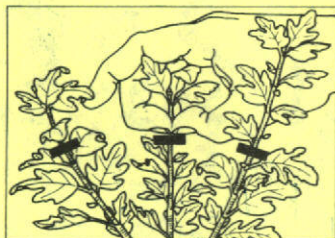
Pinch in early spring to encourage branching for shorter, fuller plants with more blossoms in the fall.